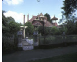
1 auld reekie royal parade parkville front view of property dec1978