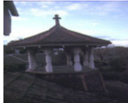
auld reekie royal parade parkville detail turret jun1980