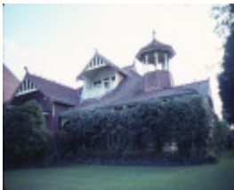
auld reekie royal parade parkville front view of house jun1980