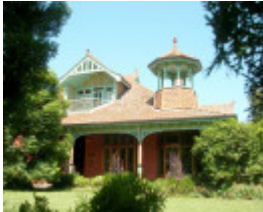
AULD REEKIE SOHE 2008