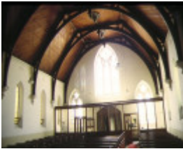
presbyterian college church royal prd parkville interior back jan1997