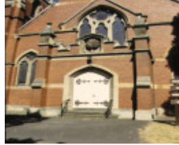
presbyterian college church royal prd parkville detail front entrance jan1997