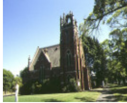
1 presbyterian college church royal prd parkville front view jan1997