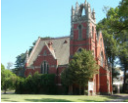
FORMER COLLEGE CHURCH SOHE 2008