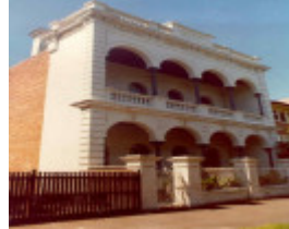
1 selvetta the avenue parkville front view