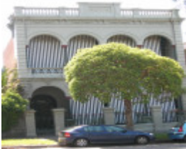
SELVETTA SOHE 2008