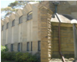
NEWMAN COLLEGE SOHE 2008