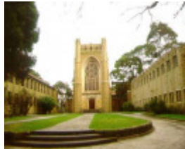
newman college university of melb entry chapel sw jun1999