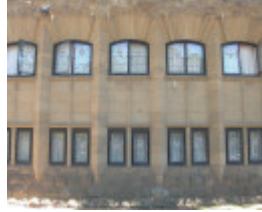
NEWMAN COLLEGE SOHE 2008