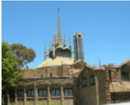
NEWMAN COLLEGE SOHE 2008