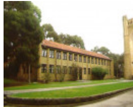
newman college university of melb kenny wing sw jun1999