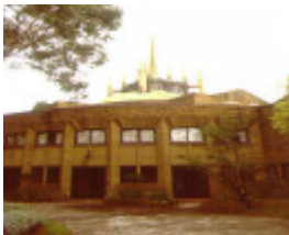
1 newman college university of melb dining hall sw jun1999