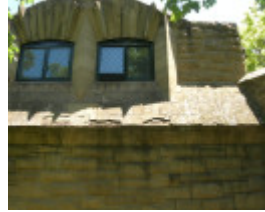
NEWMAN COLLEGE SOHE 2008