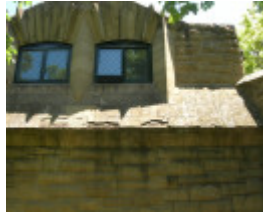
NEWMAN COLLEGE SOHE 2008