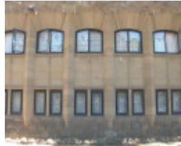
NEWMAN COLLEGE SOHE 2008