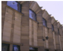
newman college university of melb side wall