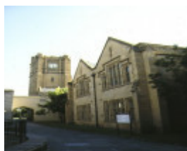
OLD ARTS BUILDING SOHE 2008 1 old arts building university of melbourne parkville east facade