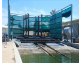
SLIP AND WINCH SHED SOHE 2008