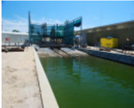
SLIP AND WINCH SHED SOHE 2008