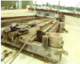
h01648 1 government slipway paynesville slip detail nov1998