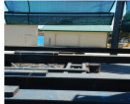
SLIP AND WINCH SHED SOHE 2008