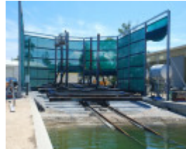
SLIP AND WINCH SHED SOHE 2008