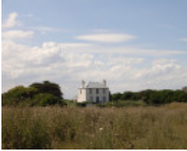
WOODBINE SOHE 2008