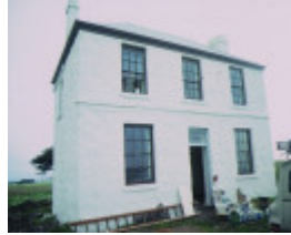
1 woodbine woodbine road port fairy front view restored