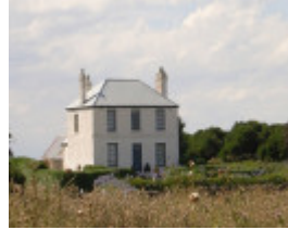
WOODBINE SOHE 2008