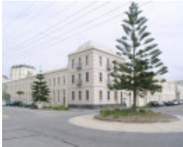
FORMER SWALLOW & ARIELL BISCUIT FACTORY SOHE 2008