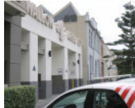
FORMER SWALLOW & ARIELL BISCUIT FACTORY SOHE 2008