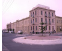
1 former swallow & ariell biscuit factory stokes street port melb corner building jun1995