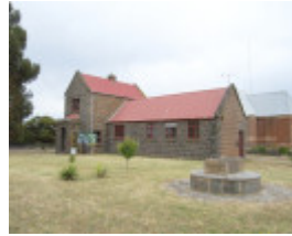
FORMER NATIONAL SCHOOL SOHE 2008