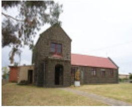
FORMER NATIONAL SCHOOL SOHE 2008