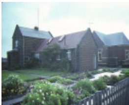
1 former national school portland side view jun1984