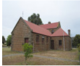
FORMER NATIONAL SCHOOL SOHE 2008