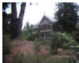
belmont raglan rd beaufort rear view house mar1985