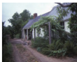
belmont raglan road beaufort side view homestead mar1985