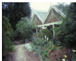
1 belmont raglan rd beaufort front view house mar1985