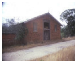
belmont raglan rd beaufort stables mar1985