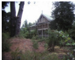
belmont raglan rd beaufort rear view house mar1985