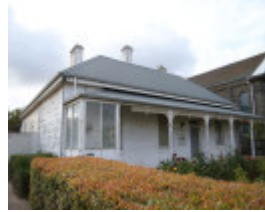
FORMER WESLEYAN CHURCH SOHE 2008