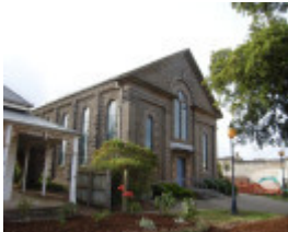
FORMER WESLEYAN CHURCH SOHE 2008