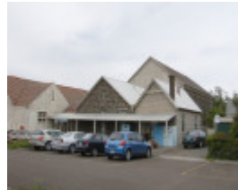
FORMER WESLEYAN CHURCH SOHE 2008