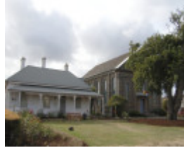
FORMER WESLEYAN CHURCH SOHE 2008