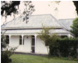
1 former wesleyan church portland manse front view