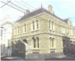
h00542 former police station and court house greville street prahran she project 2004