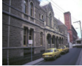
1 former police station & court house cnr greville street prahran front view oct1982