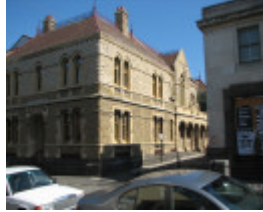
FORMER POLICE STATION AND COURT HOUSE SOHE 2008