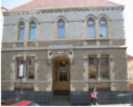
FORMER POLICE STATION AND COURT HOUSE SOHE 2008