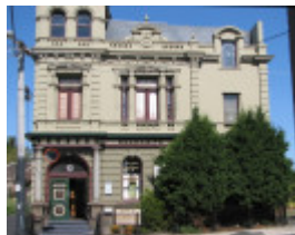
FORMER RECHABITE HALL SOHE 2008