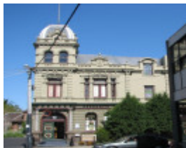
FORMER RECHABITE HALL SOHE 2008