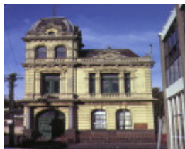
1 former rechabite hall little chapel street prahran front view