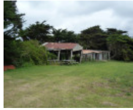
H0392 GLENAMPLE HOMESTEAD LHA 2015 7.JPG