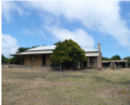
GLENAMPLE HOMESTEAD SOHE 2008