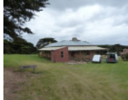
H0392 GLENAMPLE HOMESTEAD LHA 2015 1.JPG