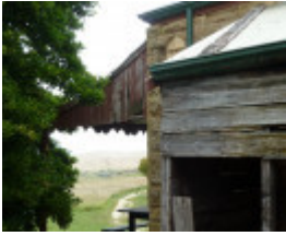
H0392 GLENAMPLE HOMESTEAD LHA 2015 5.JPG