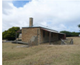
GLENAMPLE HOMESTEAD SOHE 2008