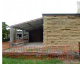
H0392 GLENAMPLE HOMESTEAD LHA 2015 3.JPG