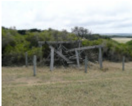
GLENAMPLE HOMESTEAD SOHE 2008