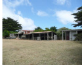
GLENAMPLE HOMESTEAD SOHE 2008