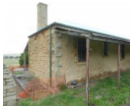
H0392 GLENAMPLE HOMESTEAD LHA 2015 4.JPG