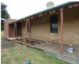
H0392 GLENAMPLE HOMESTEAD LHA 2015 2.JPG