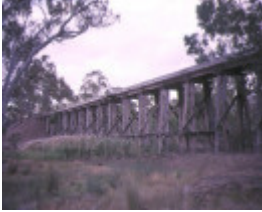
1 rail bridge over hansford creek pyalong side elevation apr 95