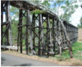
RAIL BRIDGE SOHE 2008