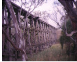
1 rail bridge over mollisons creek pyalong side elevation apr1995