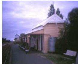
1 pyramid hill railway station wandong bendigo line side view apr 95