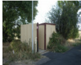
PYRAMID HILL RAILWAY STATION SOHE 2008