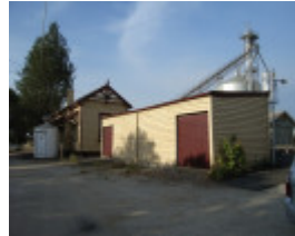
PYRAMID HILL RAILWAY STATION SOHE 2008