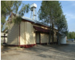
PYRAMID HILL RAILWAY STATION SOHE 2008