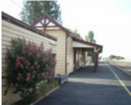
PYRAMID HILL RAILWAY STATION SOHE 2008