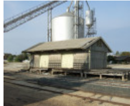
PYRAMID HILL RAILWAY STATION SOHE 2008