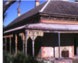
1 yurunga cust street rainbow side verandah oct1981