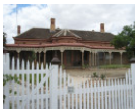
YURUNGA SOHE 2008