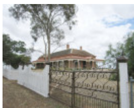
YURUNGA SOHE 2008