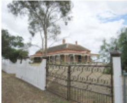
YURUNGA SOHE 2008