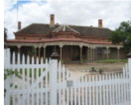
YURUNGA SOHE 2008