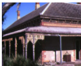
1 yurunga cust street rainbow side verandah oct1981