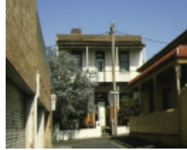
1 residence 18 berry street richmond front view