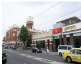
FORMER BRYANT & MAY INDUSTRIAL COMPLEX SOHE 2008