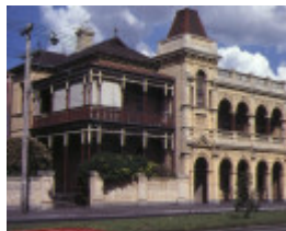
1 urbrae hoddle street richmond front view