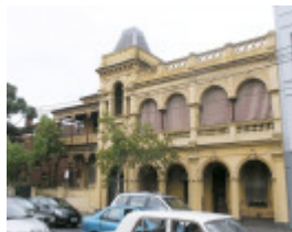
URBRAE SOHE 2008