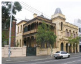
URBRAE SOHE 2008