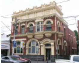
STATE BANK SOHE 2008