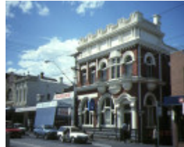
1 state bank swan street richmond front view