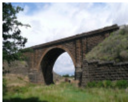
RAIL BRIDGE SOHE 2008