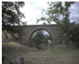
1 rail bridge over riddells creek side view dec1984