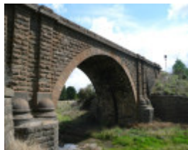
RAIL BRIDGE SOHE 2008