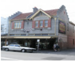
BRINSMEADS PHARMACY SOHE 2008