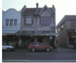
1 brinsmeads pharmacy glen eira road ripponlea front view