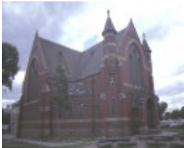
Primary School No. 1181, Bridport Street Albert Park, corner view, Dec 1984