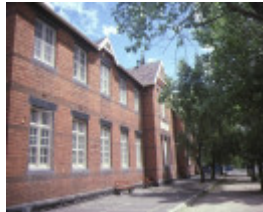
Primary School No. 1181, Bridport Street Albert Park, rear elevation, Dec 1984