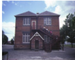
Primary School No. 1181, Bridport Street Albert Park, side entrance, Dec 1984