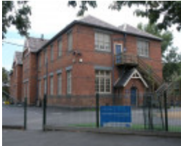
PRIMARY SCHOOL NO. 1181 SOHE 2008