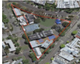
aerial extent of registration