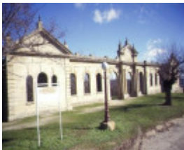
h00358 old hospital ruins church st beechworth view facade she project 2003