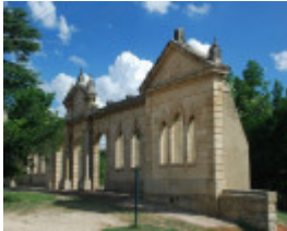
OLD HOSPITAL RUINS SOHE 2008