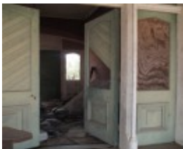
H1590 FORMER RUPANYUP RAILWAY STATION LHA 2015 8.JPG