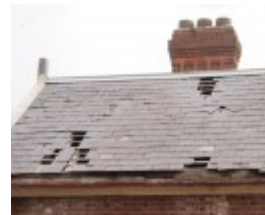
H1590 FORMER RUPANYUP RAILWAY STATION LHA 2015 4.JPG