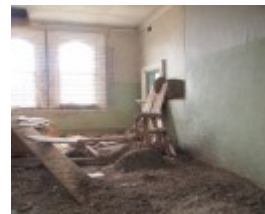
H1590 FORMER RUPANYUP RAILWAY STATION LHA 2015 7.JPG