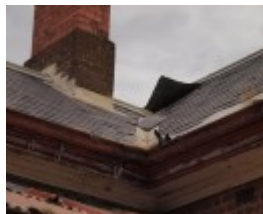
H1590 FORMER RUPANYUP RAILWAY STATION LHA 2015 6.JPG