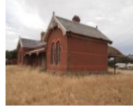
H1590 FORMER RUPANYUP RAILWAY STATION LHA 2015 1.JPG