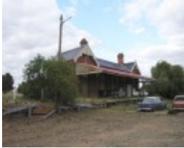
FORMER RUPANYUP RAILWAY STATION SOHE 2008