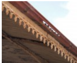
H1590 FORMER RUPANYUP RAILWAY STATION LHA 2015 3.JPG