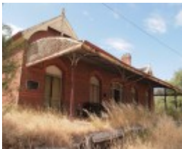
H1590 FORMER RUPANYUP RAILWAY STATION LHA 2015 2.JPG