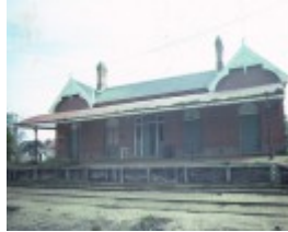
1 rupanyup railway station cromie street rpanyup trackside view jul1984