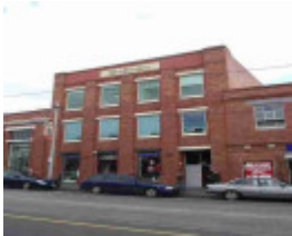
fitzroy smith street fitzroy smith street 381