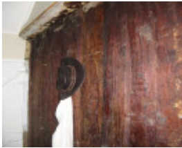
26 Finch slab wall of kitchen