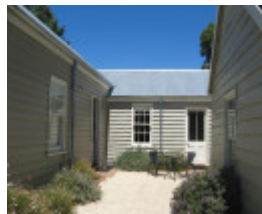
New building on left