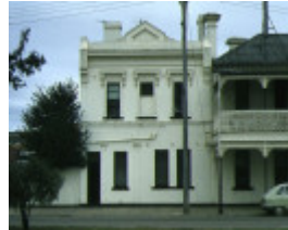
1 criterion hotel macalister street sale front view