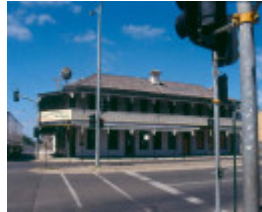
H00215 1 criterion hotel h215