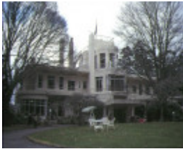
1 burnham beeches sherbrooke road sassafra front view