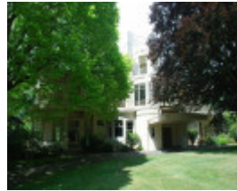
BURNHAM BEECHES SOHE 2008