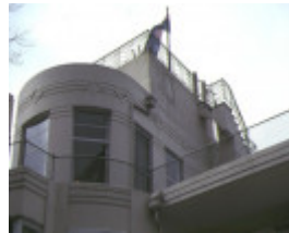
burnham beeches sherbrooke road sassafra rounded roof view