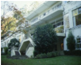
burnham beeches sherbrooke road sassafra rear view