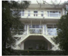
burnham beeches sherbrooke road sassafra front staircase