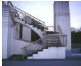
burnham beeches sherbrooke road sassafra side staircase view