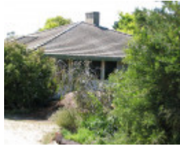
STOKESAY SOHE 2008