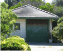
STOKESAY SOHE 2008