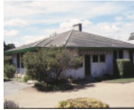
1 stokesay seaford front view