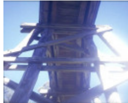
h01439 rail bridge over monbulk creek selby docking from underneath she project she