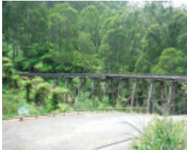
RAIL BRIDGE SOHE 2008