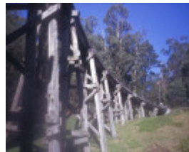
h01439 rail bridge over monbulk creek selby towards menzies creek she project she