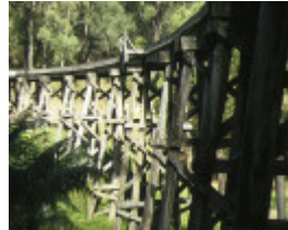
1 railway trestle bridge over monbulk creek selby side elevation apr1997