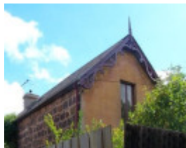
39 Nicholson Street