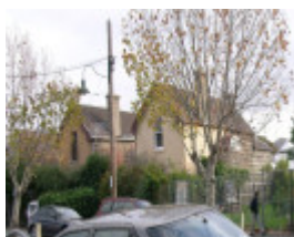
39-41 Nicholson Street.JPG