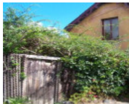
39 Nicholson Street