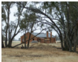
THE WOOLSHED SOHE 2008