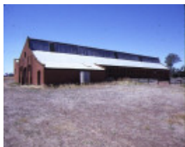
1 the woolshed east loddon serpentine side view mar1987