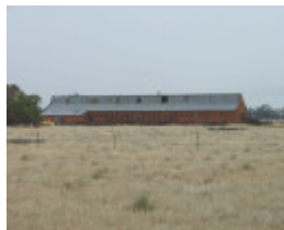
THE WOOLSHED SOHE 2008