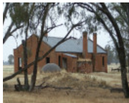
THE WOOLSHED SOHE 2008