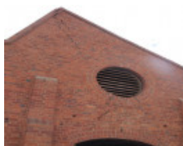
H0480 THE WOOLSHED LHA 2015 4.JPG