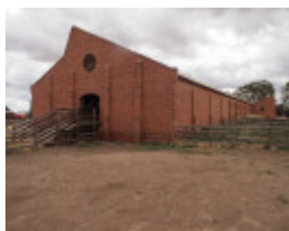
H0480 THE WOOLSHED LHA 2015 3.JPG