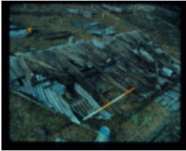
GAIRDNERS COTTAGE EXCAVATION