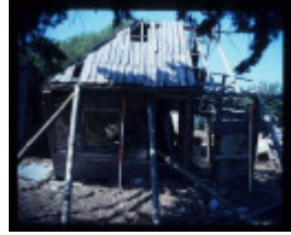
GAIRDNERS COTTAGE EXCAVATION