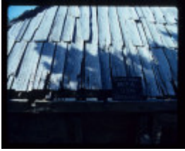
GAIRDNERS COTTAGE EXCAVATION