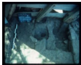
GAIRDNERS COTTAGE EXCAVATION