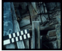
GAIRDNERS COTTAGE EXCAVATION