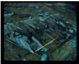
GAIRDNERS COTTAGE EXCAVATION