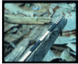
GAIRDNERS COTTAGE FEATURE