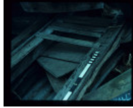
GAIRDNERS COTTAGE EXCAVATION