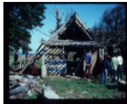
GAIRDNERS COTTAGE EXCAVATION