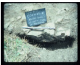
GAIRDNERS COTTAGE EXCAVATION