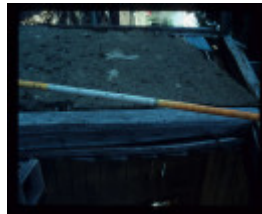
GAIRDNERS COTTAGE FEATURE