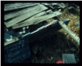
GAIRDNERS COTTAGE FEATURE