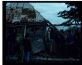
GAIRDNERS COTTAGE FEATURE