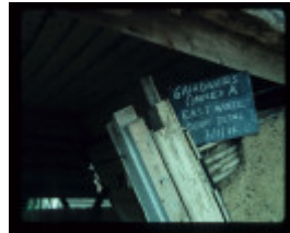
GAIRDNERS COTTAGE FEATURE