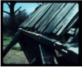
GAIRDNERS COTTAGE FEATURE