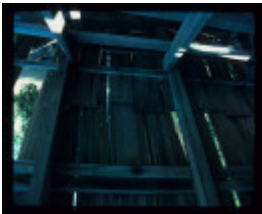
GAIRDNERS COTTAGE FEATURE