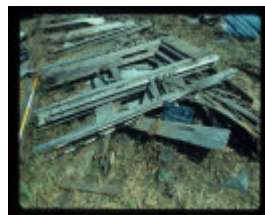
GAIRDNERS COTTAGE EXCAVATION