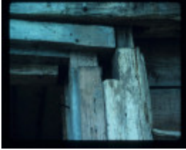
GAIRDNERS COTTAGE FEATURE