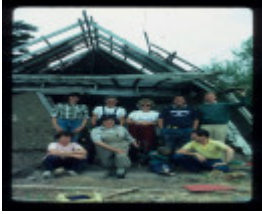
GAIRDNERS COTTAGE EXCAVATION