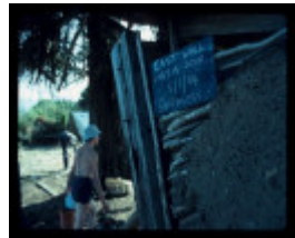
GAIRDNERS COTTAGE FEATURE