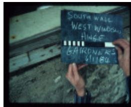
GAIRDNERS COTTAGE FEATURE