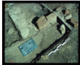
GAIRDNERS COTTAGE EXCAVATION