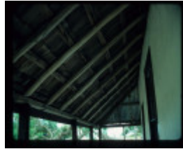
GAIRDNERS COTTAGE FEATURE