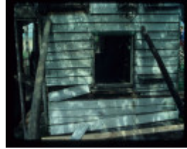
GAIRDNERS COTTAGE FEATURE