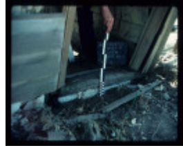
GAIRDNERS COTTAGE FEATURE