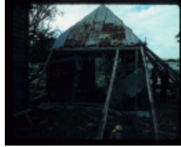
GAIRDNERS COTTAGE FEATURE