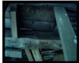
GAIRDNERS COTTAGE EXCAVATION