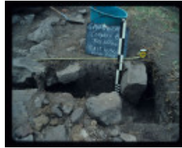
GAIRDNERS COTTAGE EXCAVATION