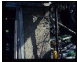
GAIRDNERS COTTAGE FEATURE