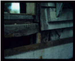
GAIRDNERS COTTAGE FEATURE