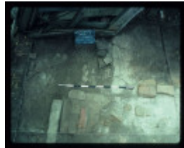
GAIRDNERS COTTAGE EXCAVATION