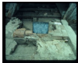
GAIRDNERS COTTAGE EXCAVATION