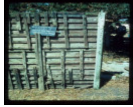
GAIRDNERS COTTAGE EXCAVATION