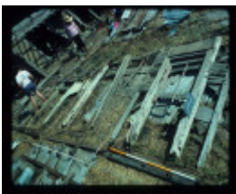
GAIRDNERS COTTAGE EXCAVATION