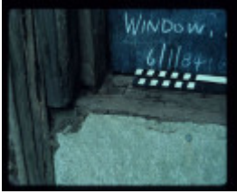
GAIRDNERS COTTAGE FEATURE