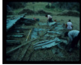
GAIRDNERS COTTAGE EXCAVATION