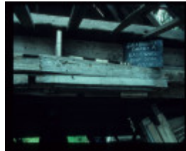
GAIRDNERS COTTAGE FEATURE