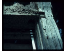
GAIRDNERS COTTAGE FEATURE