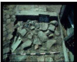
GAIRDNERS COTTAGE EXCAVATION