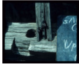
GAIRDNERS COTTAGE FEATURE