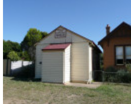
SKIPTON COURT HOUSE SOHE 2008