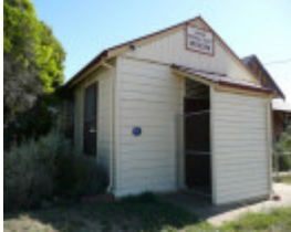
SKIPTON COURT HOUSE SOHE 2008