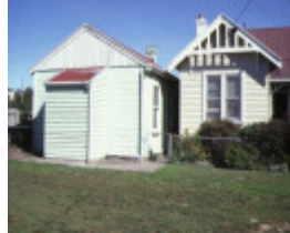
1 skipton court house front view