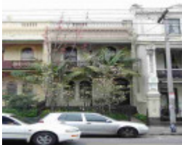
Barcelona Terrace - 37 Brunswick Street