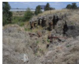
Thomas Mill - site visit 3/2/15