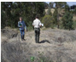
Thomas Mill - site visit 3/2/15