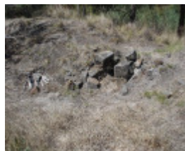
Thomas Mill - site visit 3/2/15