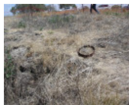
Thomas Mill - site visit 3/2/15