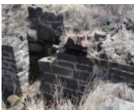
Thomas Mill - site visit 3/2/15