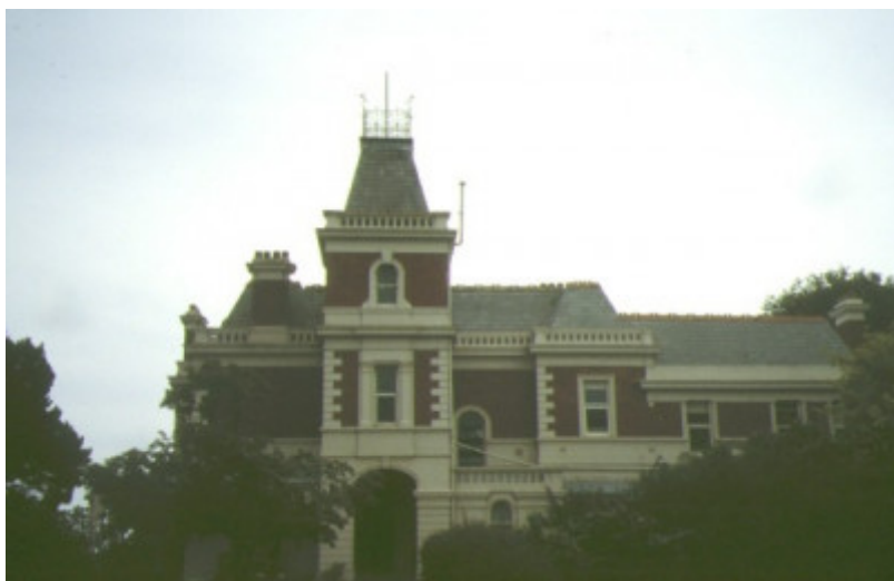
1 coolart lord somers road somers front view jan1994