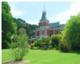
COOLART SOHE 2008