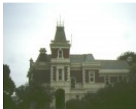
1 coolart lord somers road somers front view jan1994