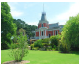
COOLART SOHE 2008