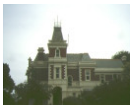
1 coolart lord somers road somers front view jan1994