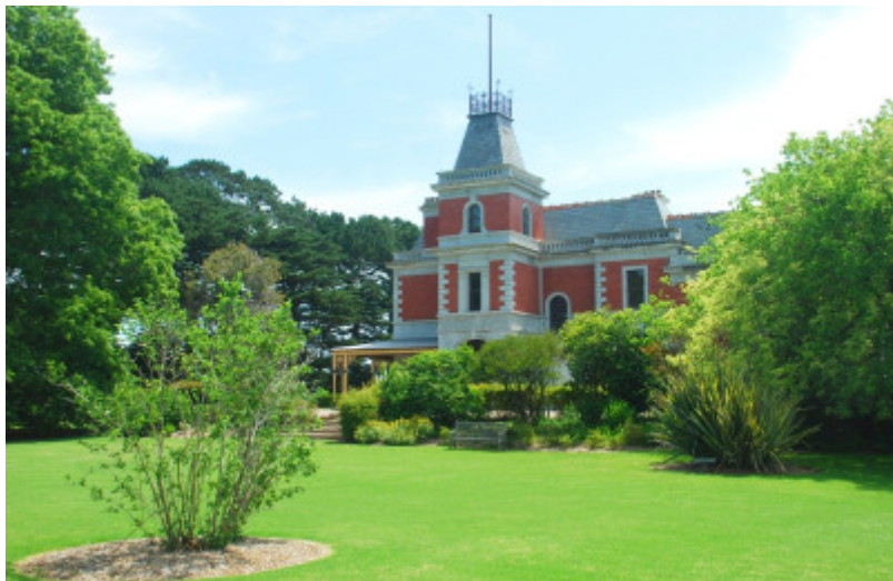
COOLART SOHE 2008