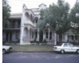
1 dalkeith 314 albert)street south melbourne front view jan1989