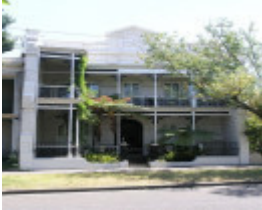
DALKEITH SOHE 2008