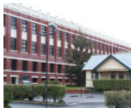
Bryant and May