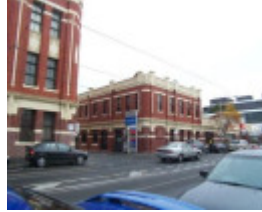
Bryant and May