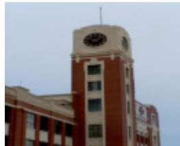
Bryant and May