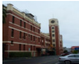
Bryant and May