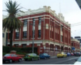
Bryant and May