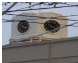
Bryant and May