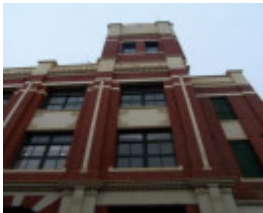
Bryant and May