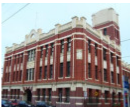
Bryant and May