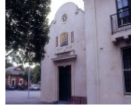
h01486 south melbourne court house and police station entry she project 2004