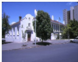
1 south melbourne court house & police station bank street south melbourne front view