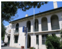
SOUTH MELBOURNE COURT HOUSE AND POLICE STATION SOHE 2008