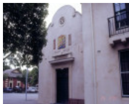
h01486 south melbourne court house and police station entry she project 2004