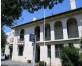
SOUTH MELBOURNE COURT HOUSE AND POLICE STATION SOHE 2008