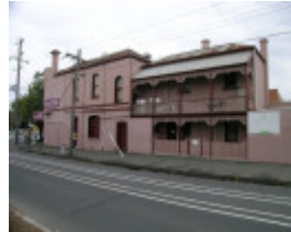
Rear of 330 Queens Parade.JPG