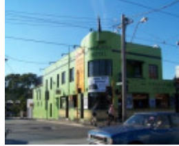
605 Victoria Street