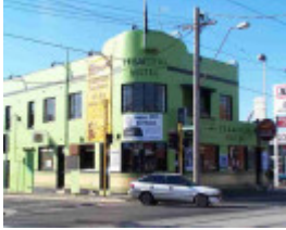
605 Victoria Street