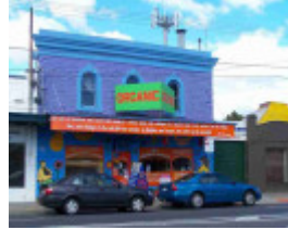
756-758 Heidelberg Road