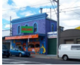
756-758 Heidelberg Road