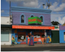
756-758 Heidelberg Road