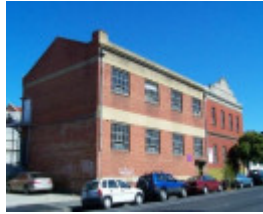
William Peatt Boot Factory