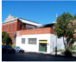
William Peatt Boot Factory