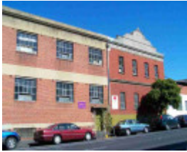
William Peatt Boot Factory