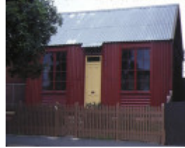
1 iron house coventry street south melb front view