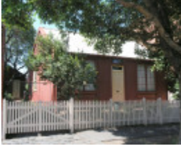
IRON HOUSE SOHE 2008