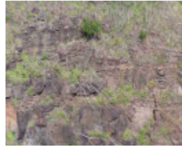
Fitzroy City Council Quarry