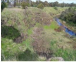
Fitzroy City Council Quarry