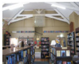
Sunday School interior