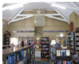
Sunday School interior